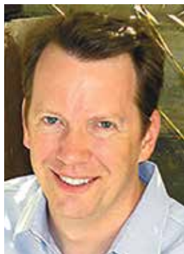
Sean M. Carroll /// @seanmcarroll

Research Professor of Physics, California Institute of Technology