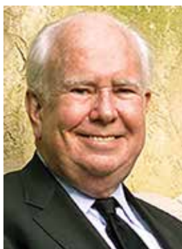
Peter H. Raven

President Emeritus, Missouri Botanical Garden and George Engelmann Professor Emeritus of Botany at Washington University in St. Louis