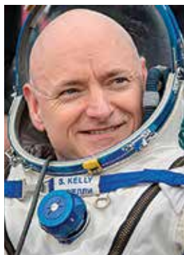
Scott Kelly /// @StationCDRKelly

Retired Astronaut and Retired U.S. Navy Captain New York, NY