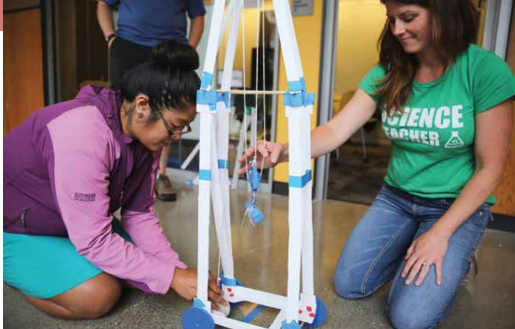
Short Course SC-5: Blending the E and the S in STEM