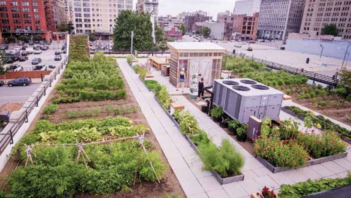
Photo of FOOD ROOF Farm