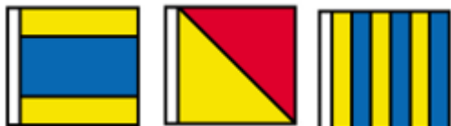
Figure out the following words using the flags.

Letters “A” and “B” are different in shape from the other flags. Explain how they are different.