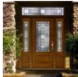
Front door with Frosted Panels

Which part of the house will allow the most light to be seen on the inside? Place a circle around the part of the house that my friend should shine the flashlight on to signal me that they are here.