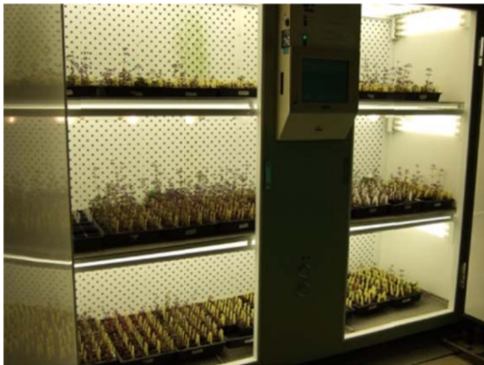
Figure 3. Plants growing in controlled-environment chambers