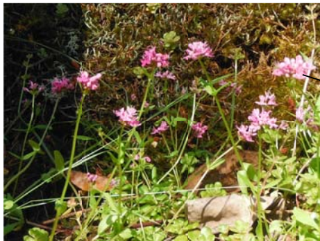
Figure 2a. Short phenotype