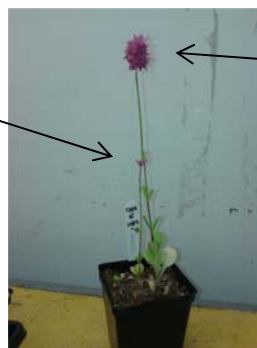
b. Comparison of short and tall phenotypes