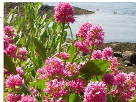
c. Tall phenotype