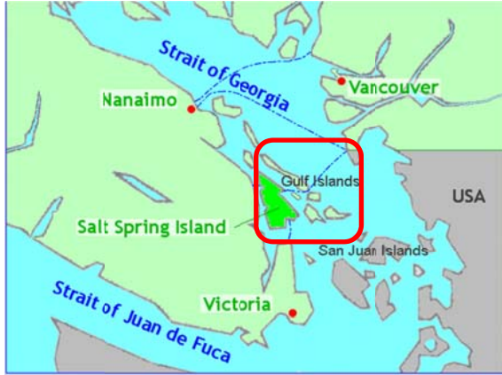
Figure 1a. Islands in the Salish Sea (Strait of Georgia)