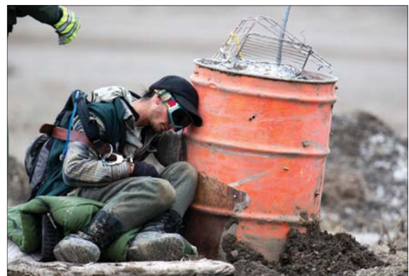
Figure 3. Buffalo Field Campaign activist blocking bison slaughter.

Comfrey Jacobs is an activist with the Buffalo Field Campaign (BFC), an advocacy group based in West Yellowstone, Montana. Its volunteers conduct daily patrols to monitor and document the hazing, shooting, and slaughter of Yellowstone bison. Wrapped snugly in caps and jackets, they are hot on the trail of hunters, Department of Livestock agents and Yellowstone National Park officials involved with what they call bison "mismanagement." They aim to draw public attention to their concerns through video postings on YouTube and the organization's website. The BFC website notes, "there are tens of thousands of acres of public lands surrounding Yellowstone that could sustain thousands more" bison. In other words, the last remaining great herd of free-roaming, genetically pure American buffalo should be respected and protected as wildlife, rather than corralled and slaughtered as livestock (Buffalo Field Campaign, 2014).