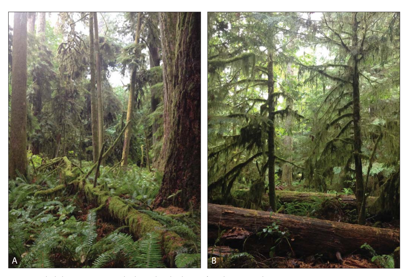
Figure 1. Cathedral Grove, Vancouver Island, British Columbia.