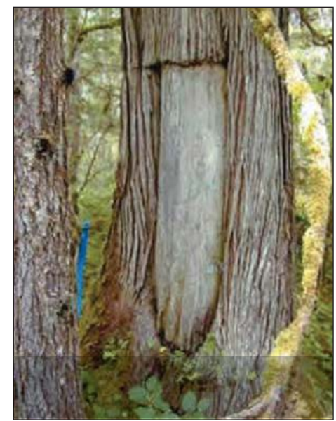
Figure 3.

Because of the close proximity to An'acla, an archeological assessment is required before a harvest plan is permitted. The independent archeological assessment, reported by Baseline Archeological Services in July of 2005, identifies at least 10 sites of "archeological concern," most of these being culturally modified trees (or CMTs). (A CMT typically has had barked stripped away for use in making baskets or cloth; see Figure 3.) As heritage objects, CMTs are protected by a complex set of laws. The Heritage Conservation Act quantifies the significance of these trees based on the age of the tree, time of modification, and condition of the tree. The government recommends canceling or delaying the harvest plan and requires a "Site Alteration Permit" when CMTs have been identified. Violation of this protection can result in a maximum fine of $1,000,000 for a corporation. If permits are granted, consultation with nearby First Nation bands ensues to establish appropriate buffers of trees that are to remain around each of the significant CMTs.