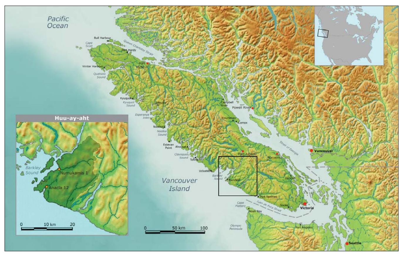
Figure 2. Map of Huu-ay-aht tribal territory.

"The Last Spruce Grove" is a 100-hectare parcel of land adjacent to the Huu-ya-aht First Nations (HFN) village of An'acla. It also lies near the town of Bamfield, which houses a marine station, and is across the gravel logging road from the start of the West Coast Trail, which is popular with hikers. The spruce grove is privately owned by a timber company, which has submitted a plan to harvest this stand of trees.