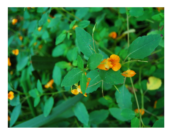
Figure 3. Jewelweed.

Your job is to use the scientific method to plan an experiment to determine if jewelweed is an effective treatment.