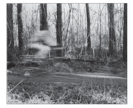
(g) 1/15 s