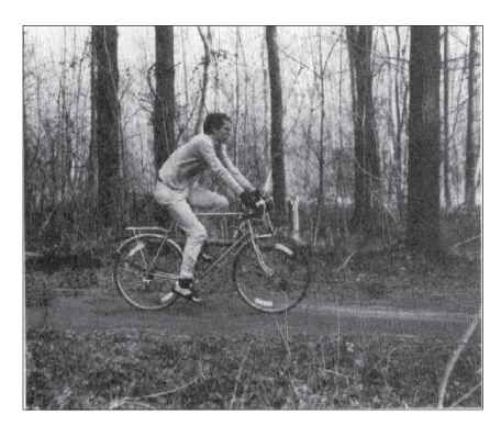
Figure 4.21. The action-stopping power of a shutter. Falk, Brill & Stork. Seeing the Light: Optics in Nature, Photography, Color, Vision, and Holograph. (John Wiley & Sons, Inc., 1986): Figure 4.21, pp. 123-4. This material is used by permission of John Wiley & Sons, Inc. Copyright © 1986 by John Wiley & Sons, Inc.