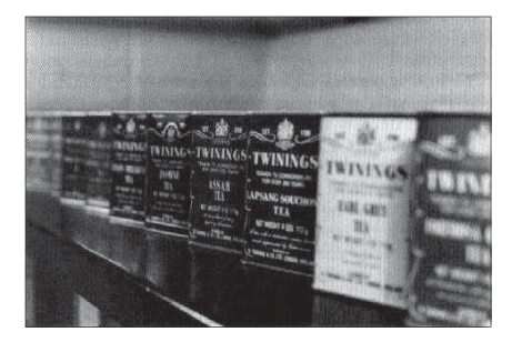
(d) f/5.6 at 1/125 s