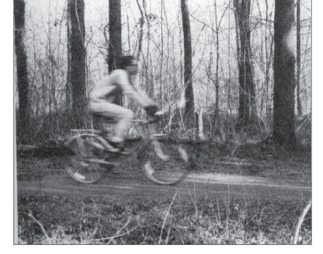
(e) 1/60 s