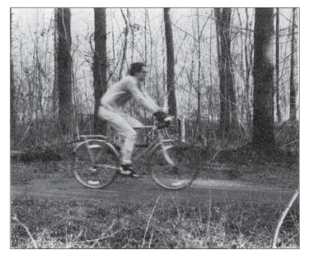
(d) 1/125 s