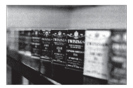
(f) f/2.8 at 1/500 s