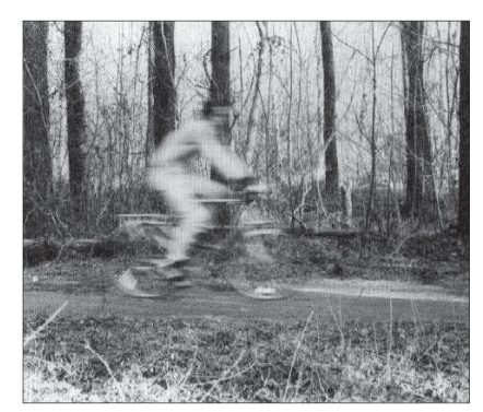
(f) 1/30 s