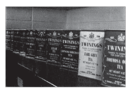
(a) f/16 at 1/15 s

Figure 4.31. 35-mm photographs with increasing stop sizes, decreasing depth of field. Falk, Brill & Stork. Seeing the Light: Optics in Nature, Photography, Color, Vision, and Holograph. (John Wiley & Sons, Inc., 1986): Figure 4.31, p. 131. This material is used by permission of John Wiley & Sons, Inc. Copyright © 1986 by John Wiley & Sons, Inc.