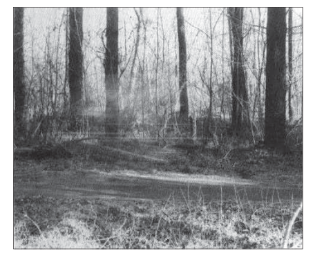
(i) 1/4 s