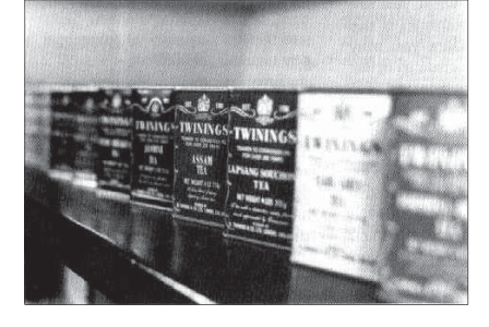
(e) f/4 at 1/250 s