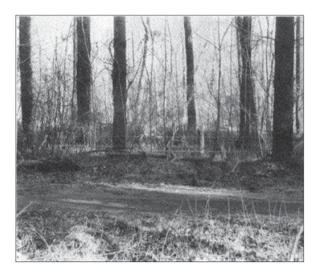
(j) 1/2 s