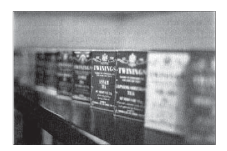
(g) f/2 at 1/1000 s