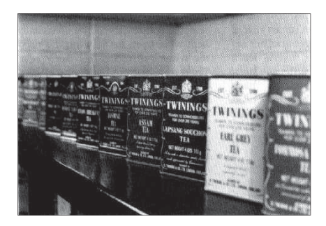
(c) f/8 at 1/60 s