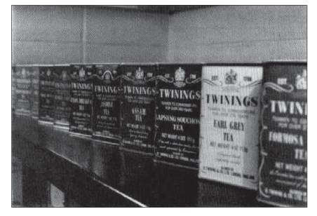
(b) f/11 at 1/30 s