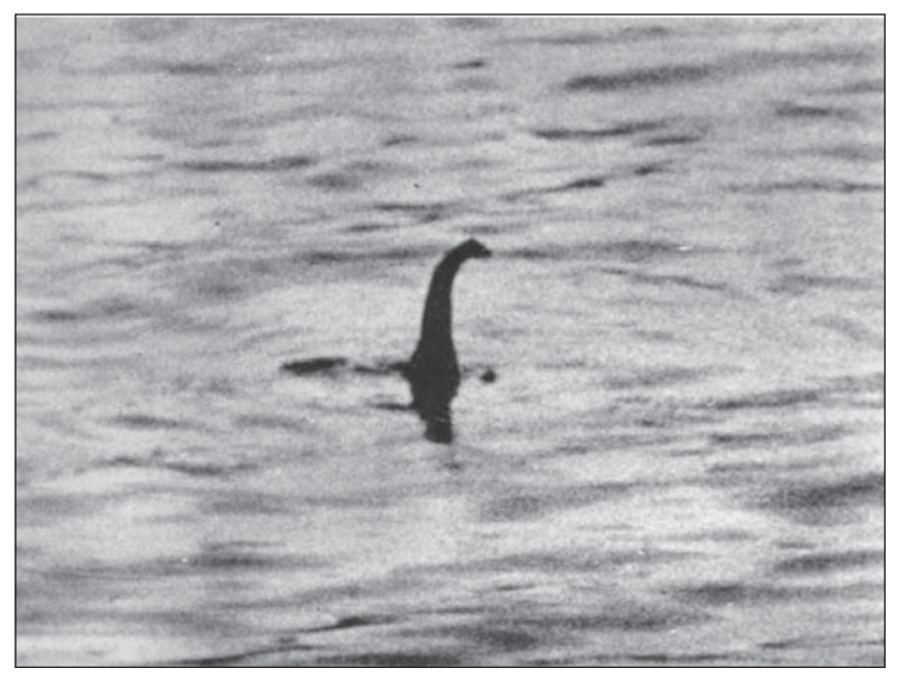
Figure 1. The "Surgeon's Photo" of the Loch Ness Monster.

"Wow, that is big" Victoria responded. "And what do they eat?"