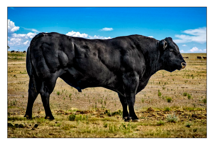
Figure 1. The pictured bull is 75% Piedmontese, exhibiting extreme muscle hypertrophy or "double muscling" due to a variation in the myostatin gene.

Back to your question about how the little boy from Germany may have achieved increased muscle mass. To summarize, the DNA in our cells contains genes, the information that is used to make proteins. DNA is used as a template to generate messenger RNA (mRNA) using a process called transcription. One of the main proteins involved in transcription is RNA polymerase, which incorporates RNA ribonucleotides into the elongating RNA strand. RNA polymerase uses its enzymatic activity to form the phosphodiester bonds needed to hold the individual ribonucleotides together. The mRNA from transcription is then translated with the help of the ribosome. Ribosomes are a complex of proteins and another type