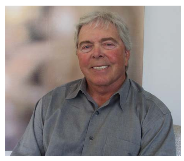
Figure 5. Herbert Boyer, co-founder of Genentech.

Genentech used a different strategy than Biogen and ultimately was successful. Since the sequence of human insulin was known, instead of isolating the human insulin gene from DNA samples, scientists at Genentech chemically synthesized the human