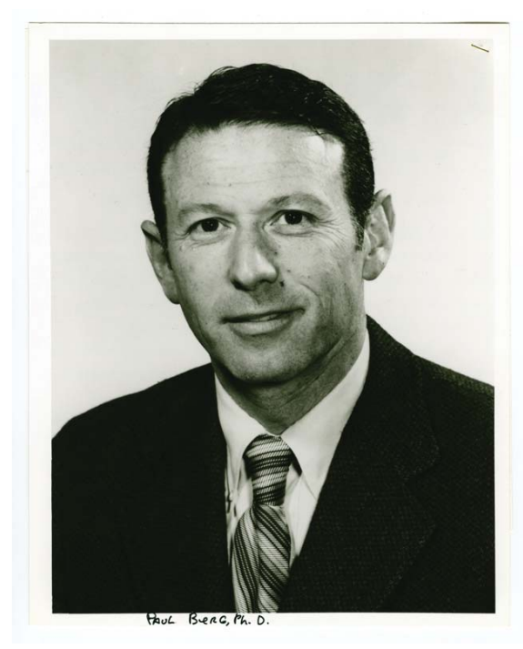
Figure 4. Photo of Paul Berg, National Library of Medicine, public doamin, http://profiles.nlm.nih.gov/CD/B/B/L/L/.

In 1975, the Asilomar Conference on Recombinant DNA, coorganized by Berg, took place in California where 140 scientists,