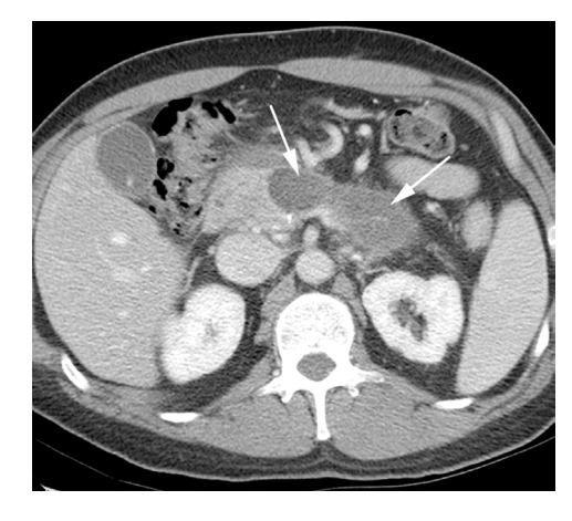
Figure 3. Frank's CT Scan