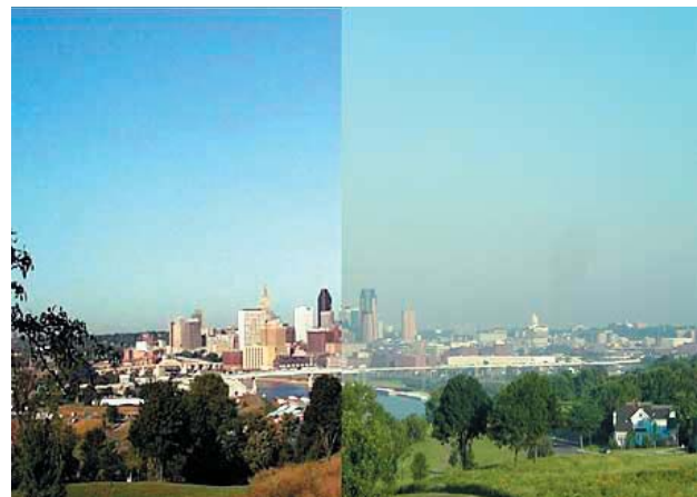
Figure 6. This composite photo of the St. Paul skyline provides a visual comparison of two different levels of fine particles—PM 2.5 levels of 5 µg/m 3 (left) to 35 µg/m 3 (right). Notice the difficulty in seeing buildings in downtown St. Paul on the right half of the picture. The daily standard for PM 2.5 is 65 µg/m 3 (micrograms of particles per cubic meter of air).

In Minnesota, sulfate is an important component of haze. Nitrate and organic carbon are significant in winter and summer, respectively. Since some fine particle pollution blows into Minnesota from