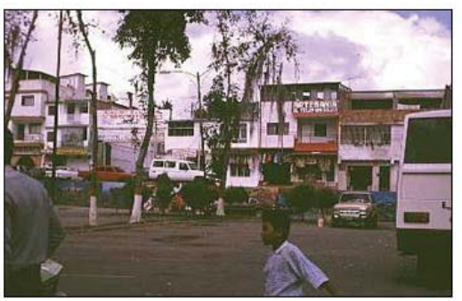
Fig. 1 The Market Place

"I just don't know how I am going to pay for this fertilizer," said Marco, a disgruntled peasant farmer growing beans in a cleared forest pasture. "This is only my second year of farming in the area, but already the crops are growing poorly, and it is hard to get rid of the weeds. They want $300 per hectare for fertilizer and pesticides, but the land is not worth that much money. All I can afford is the $70 per hectare to clear more forest."