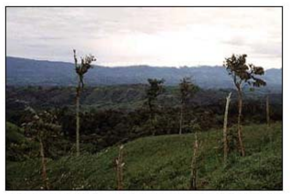
Fig. 5 Abandoned land following pasture degradation.

attempts to bring land under cultivation or conversion to pasture for cattle have failed in the long run without supplements from fertilizers and pesticides. Cattle numbers decline from an average of two healthy head per hectare following clearing to less than 0.3 head per hectare 20 years following clearing (Serrão and Homma 1993). After just two years of grazing, some cattle exhibited 20% mortality and complete reproductive failure due to a lack of phosphorus in pasture grasses (Buschbacher 1987). Land reclamation efforts often require $250 to $475 per hectare for fertilizers and weed management, an enormous sum compared to a cost of $70 to clear an additional hectare of virgin forest (Serrão and Homma 1993, Southgate 1998).