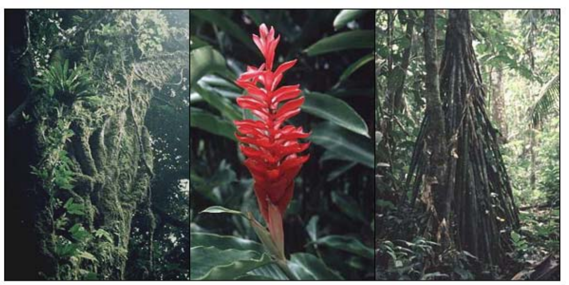
Fig. 2 Examples of wet tropical rainforest communities.

tropics as the source of 50 to 90% of all species on Earth (Wilson 1992); the richest forests often support over 300 tree species per hectare, approximately the same number of tree species in all of North America.