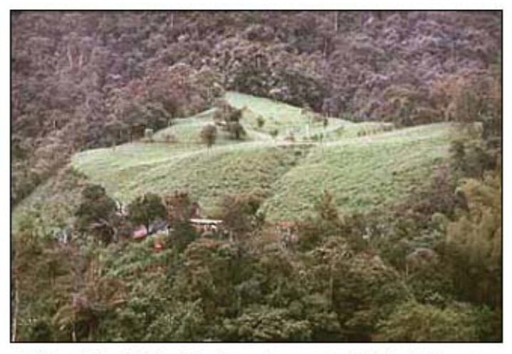
Fig. 3 Small clearing in primary tropical rainforest

These are some of the most hotly debated environmental questions today, leading to international conventions like the United Nations Convention on Biodiversity at the Rio de Janeiro "Earth Summit" in 1992.