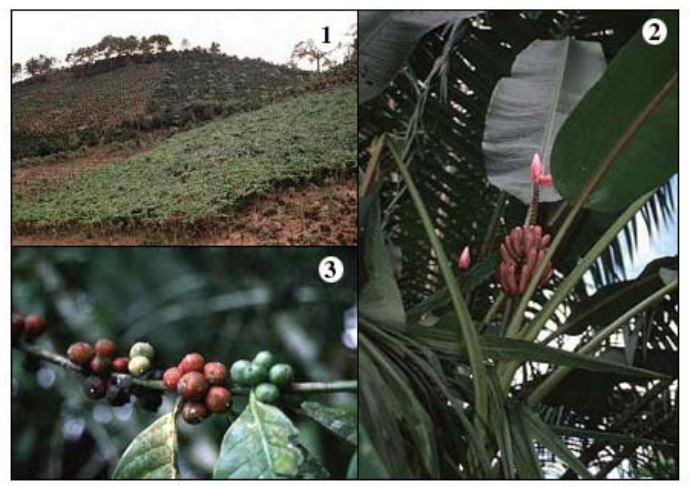
Fig. 6 (1) large coffee plantation, (2) bannana tree, (3) coffee beans.

However, this value is probably a significant overestimate because it is based on a forest stand containing a high fraction of commercial species, and it does not account for declining prices as more goods are brought to markets (Southgate 1998). Intensive agroforestry programs that farm rapidly growing commercial trees or a mix of trees with crops, such as coffee, are gaining popularity (Grainger 1993, Southgate 1998). Grainger (1993) suggests that a commercial plantation of teak may produce 245m^3 of timber per hectare over a 65-year period. Gmelina may produce 150m^3 per hectare over a 10-year period. Assuming a tropical timber value of $20-35/m^3 , this style of production may