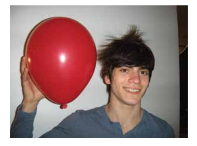
FIGURE 5.5: When you bring a charged balloon near your head, it causes your hair to stick out.

Your charged hair might stick out in other directions too. The charges on your hair are trying to get as far from each other as possible. There might even be enough charges on the balloon and your