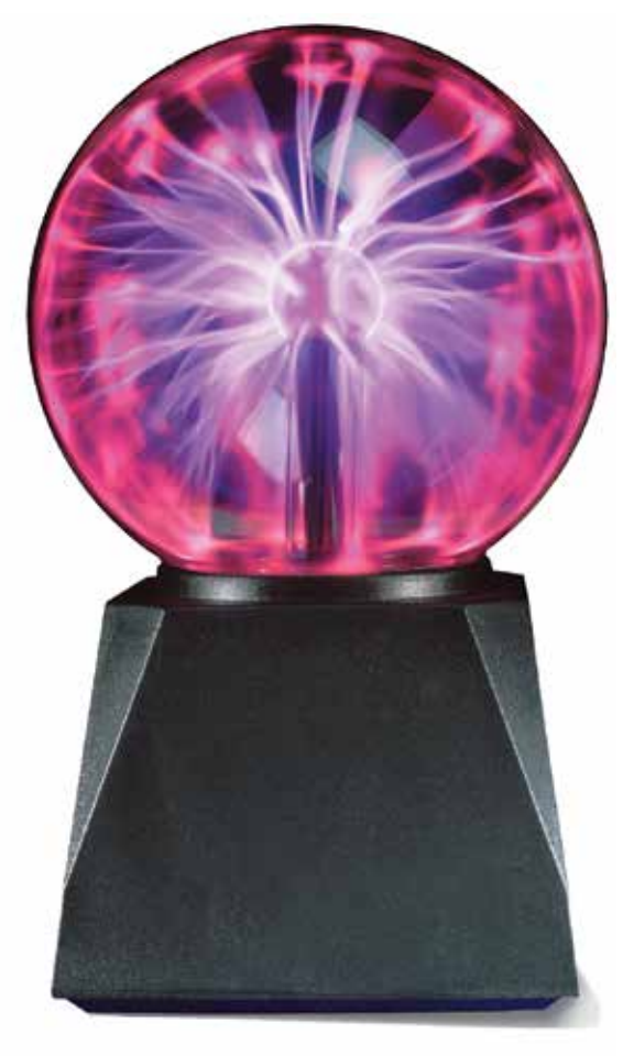
FIGURE 5.2: Plasma Globe