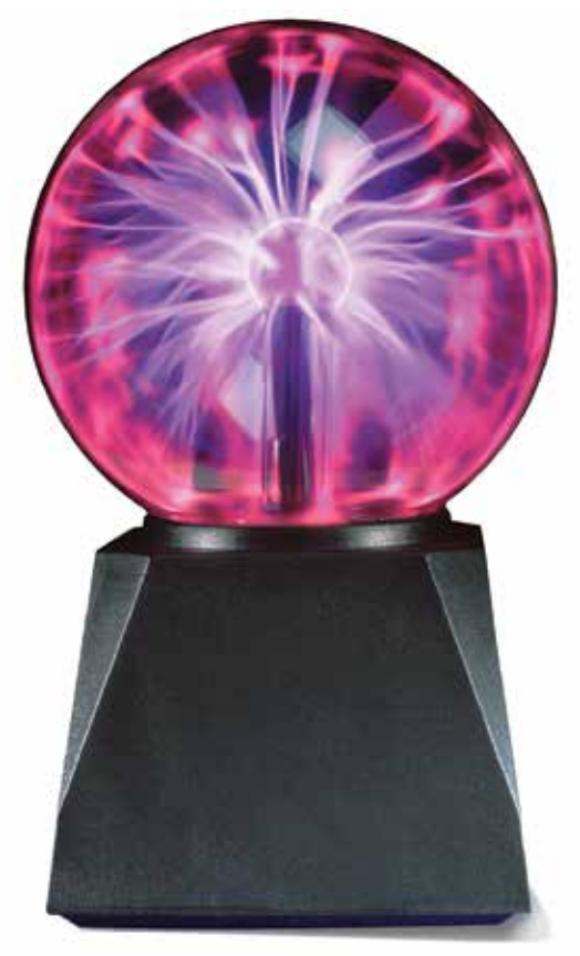
FIGURE 5.8: Plasma Globe