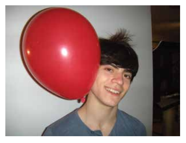
FIGURE 5.6: With enough charge, the balloon will stick to your head without you holding it.

When two things have the same charge, they push each other apart. We say that they repel each other. With the Fun Fly Stick (Figure 5.7, p. 46), both the flyers and the stick have positive charges.