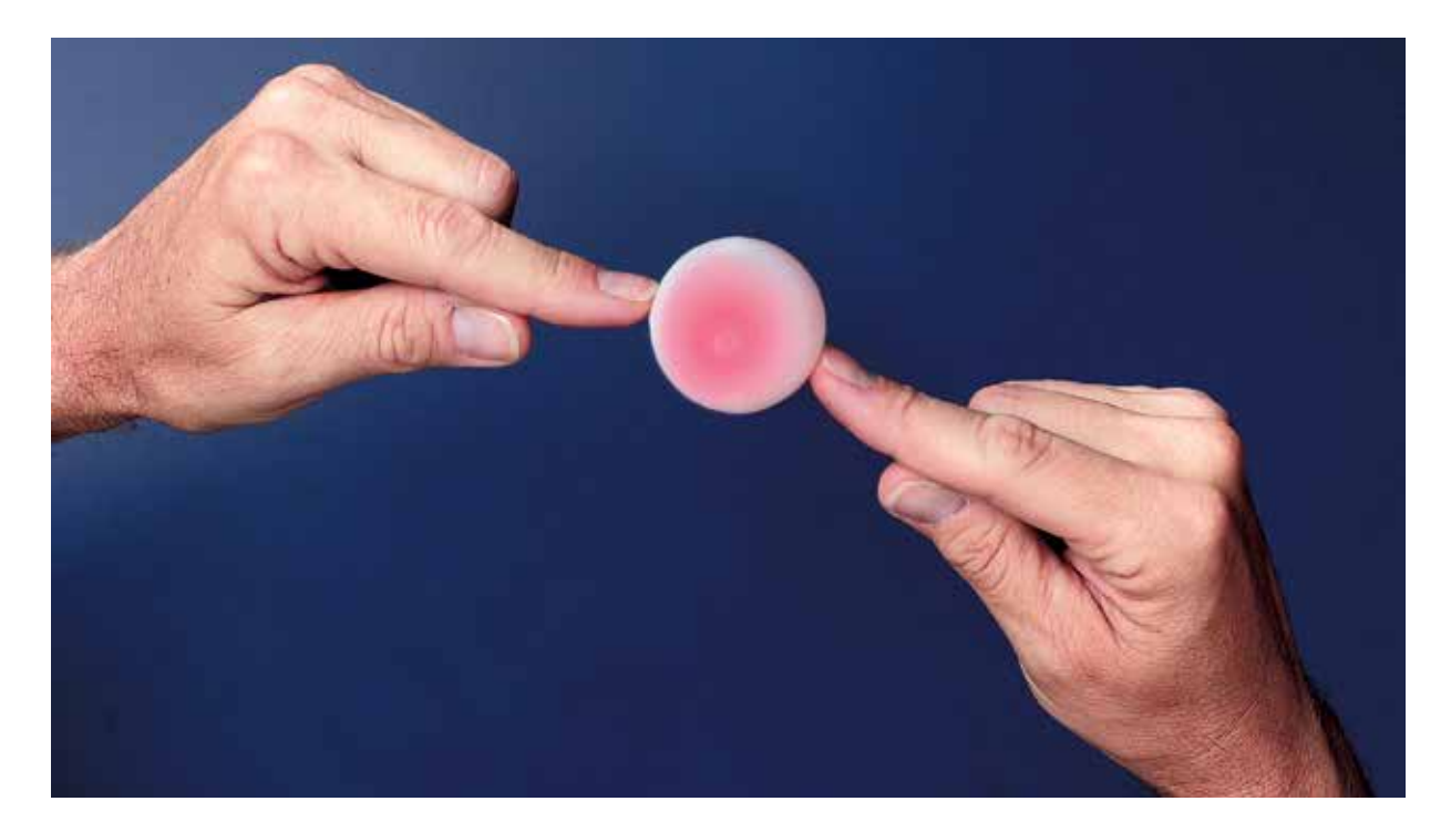
FIGURE 5.9: Energy Ball