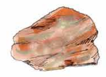
Some were dull.