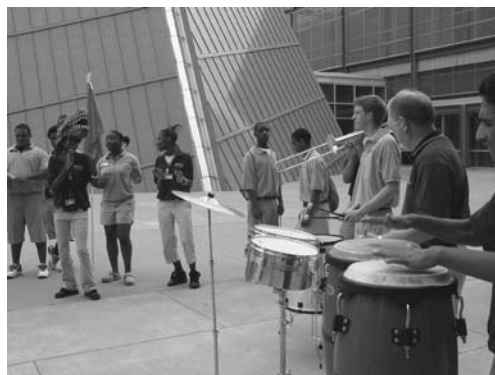
Samba band greets children.