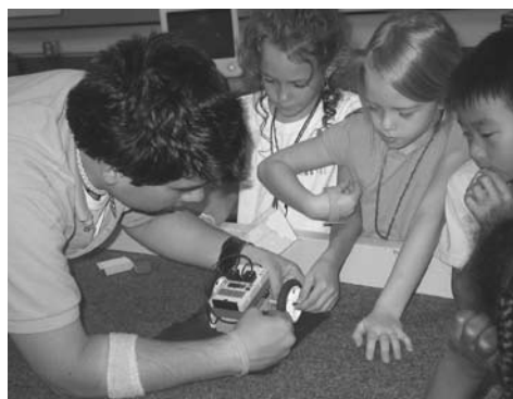
Teacher's Assistant leads small group.