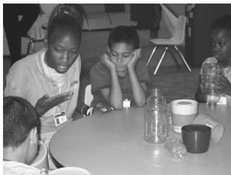
Theater T.A. guides participants.

Staff members participated in staff development sessions addressing learning theory and constructivist approaches to learning and discipline. The discussions led to practical application of these new approaches that were implemented into inquiry-based science activities. The benefits also included confidence among the staff in addressing and anticipating common issues with groups of children, and subverting behavior that could negatively impact the group's experience.