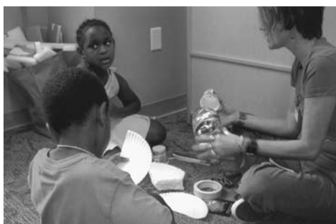
Creative art teacher works with students.