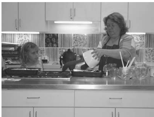
Test kitchen activity reveals effect.