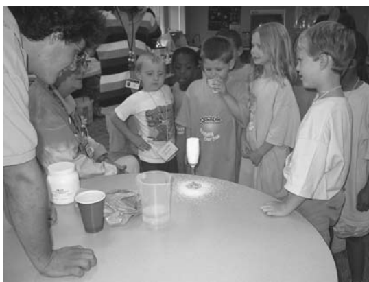
Students predict and discuss outcomes.