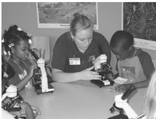
Small-group activity with a 1:6 ratio.