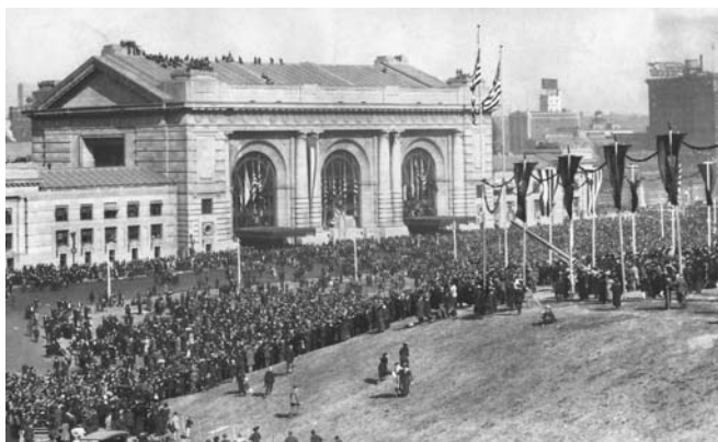
Union Station in 1917.

The metropolitan area's population of more than 1.7 million is more diverse than some would expect, breaking down as follows: 80.80% White, 12.80% Black, 5.2% Hispanic, 1.6% Asian and 0.50% Native American. Public school districts in the area include some of the nation's highest ranked as well as some of its worst.