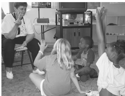
A teacher assesses prior knowledge.