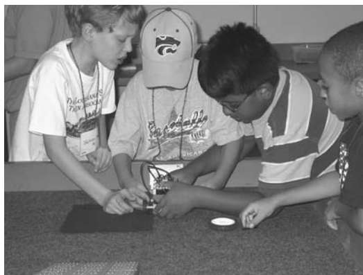
Small team works to redesign a Lego machine.