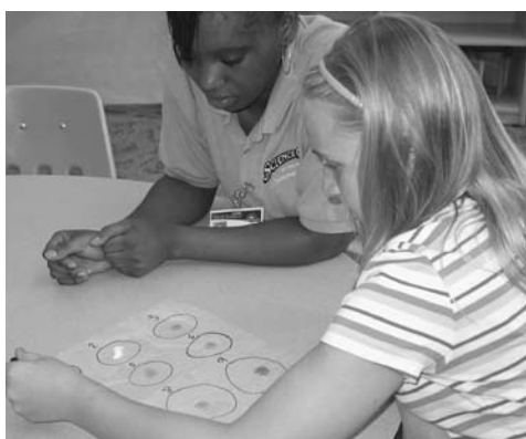
Students analyze a mystery substance.