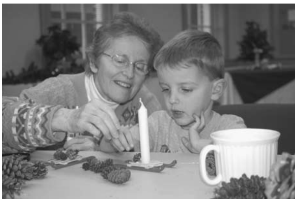
After learning about pinecones, grandmother and grandson collaborate on a creative project.