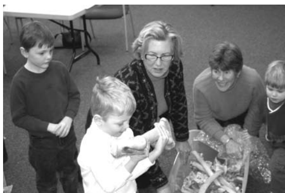
Grandparents and grandchildren examine a bull skeleton following a reading of a grandparent favorite, Ferdinand the Bull .

Grands Are Grand also aims to rekindle or supplement grandparent interest in the natural world and the museum. The informal atmosphere lends itself to questions and discussion between the adults and the instructor. Grandparents have commented on their own learning experiences during the programs.