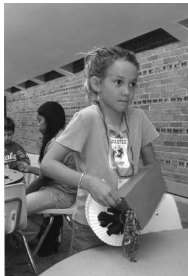
Child with flower pot.