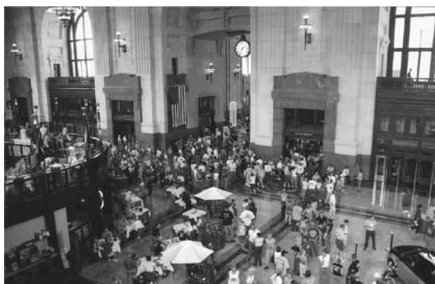
Interior of Grand Hall.

home to a permanent rail exhibit with vintage rail cars ( KC Rail Experience ) and an interactive science center ( Science City ), as well as theaters, restaurants, shops, and meeting spaces. Today the station is once again a busy Amtrak stop.