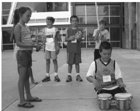
Children with instruments.