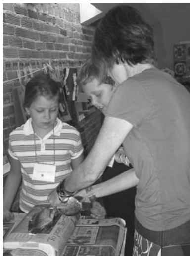
Students in creative expression class.

Teachers adjusted lessons to help students understand the concept, or modified the lesson to the level of the child’s under-