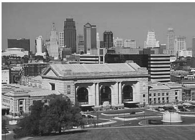
Grand Hall of Union Station.

home to a permanent rail exhibit with vintage rail cars ( KC Rail Experience ) and an interactive science center ( Science City ), as well as theaters, restaurants, shops, and meeting spaces. Today the station is once again a busy Amtrak stop.