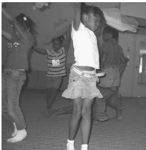
Students perform life cycle of a butterfly.