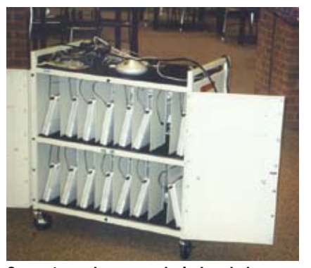
Computers, charger, and wireless hub on wheels

front row of lights in the instructional area can be wired so that they can be turned off when projection is needed, but students need light to take notes or see their paper.