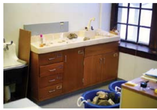
"Rinse away" sink

Perimeter countertops at student height should have one sink for every four or five students. Provide one large (15 \times 25 \times 10 \text{ inch}) sink and an adjacent 6- to 8-foot section of counter space, 36 inches high, for the teacher's use. Every sink should have hot and cold water. At least one must have wrist blade handles and be accessible to students with disabilities.