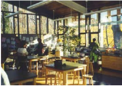
A specialized science classroom

tages to having separate science classrooms for kindergarten through second-grade students and for third- through fifth-grade students, although the facilities are very similar. The furnishings for each are described below.