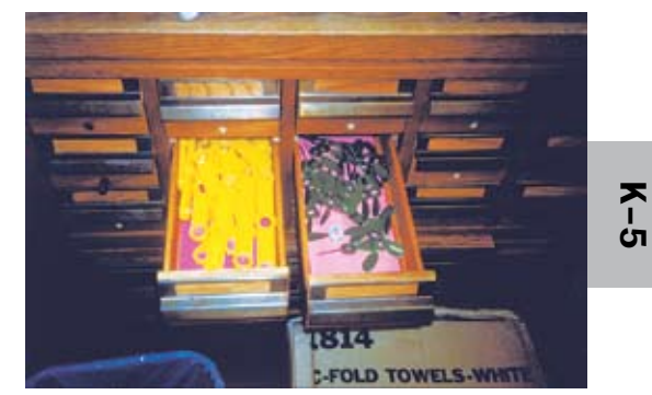
Library card catalog unit

Each type of chemical or piece of equipment requires its own type of storage. Alcohol, acids and bases, and