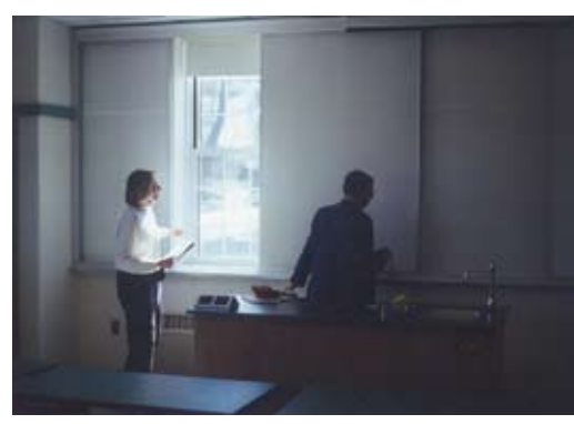
Bulletin boards that roll across the window

candles per square foot of floor surface and 75 to 100 footcandles at the work surface. Lighting design must be handled carefully to avoid washing out projected images while providing enough light to enable students to see their tabletops. If computers are to be used in the room,