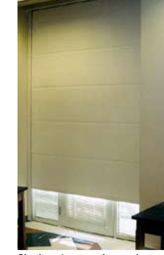
Shades at a greenhouse door

front row of lights in the instructional area can be wired so that they can be turned off when projection is needed, but students need light to take notes or see their paper.