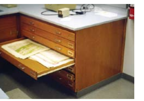
Poster drawers under 3-foot-deep counter

All countertops in classrooms, preparation rooms, and storerooms should have plastic laminate or other durable finishes resistant to water and chemicals. Countertops near a water source should have a backsplash with no seams. Give priority