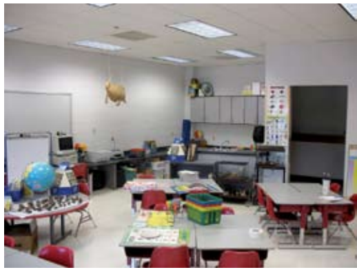
A multiple-use classroom planned for science

The type and arrangement of space desirable for students in kindergarten through second grade requires great flexibility. Fixed student workstations should be avoided in favor of flat-topped movable tables. For safety reasons, there should always be a minimum of 4 feet between the perimeter counters and the tables. It is important for planners to verify that the floor space will be suitable for small-group arrangements around a central, movable teacher's table or cabinet, as well as for traditional classroom seating and other arrangements. Allow at least 4 feet on all sides around each grouping of tables. In the classroom-type arrangement, provide a minimum of 8 feet from the front wall of the classroom to the first row of tables. The teacher will then be able to move around