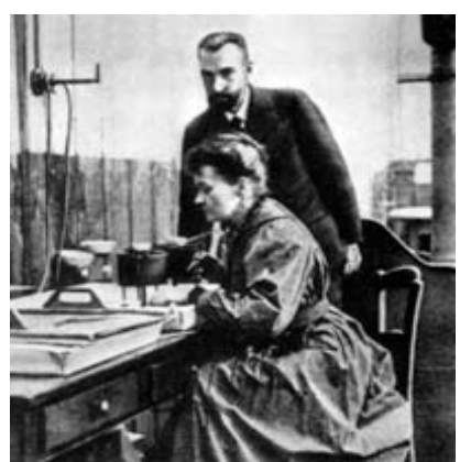
Figure 1: Something out of Nothing © 2006 Carla Killough McClafferty, Used with the permission of Farrar, Straus, and Giroux.

Apples and oranges ... and lychees and loquats—how can one compare? That's the challenge when a team of NSTA's best science educators attempt to select the best of each year's science trade books.