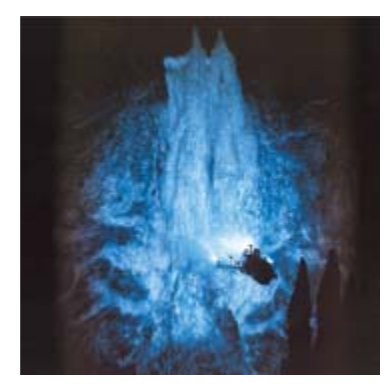
Figure 3: Diving to a Deep-Sea Volcano. © 2006, written by Kenneth Mallory, Houghton Mifflin Co.