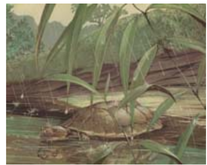
Figure 4: Illustration by Michael Rothman from Here Is the Tropical Rain Forest. © 2006. Michael Rothman. Used with permission of Web of Life Children's Books.