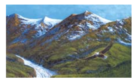
Figure 2: Used with permission of the publisher,Walker Books for Young Readers.