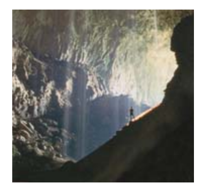
Figure 2: Cave Sleuths: Solving Science Underground by Laurie Lindop. Text © 2006 Laurie Lindop. Published by Twenty-First Century Books, a division of Lerner Publishing Group. All rights reserved.

Cave Sleuths. Laurie Lindop. Illustrated with photographs. Twenty-First Century Books/Lerner Publishing Group. 80pp. Library ISBN 0-7613-2702-9, $27.93. (I) This book takes you into the world of caves and cave scientists. It provides information about how caves are formed, how scientists are exploring caves to learn more about how the Earth system functions, and how the organisms found in caves might be of use to humans. Source Notes, Index, Reading List. DAG (VIII, V)