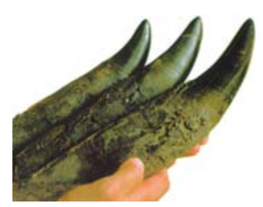
Figure 1: Illustration © 2003 by Alan Barnard from New Dinos by Shelley Tanaka, Atheneum Books for Young Readers. Used with permission of Atheneum Books, an imprint of Simon & Schuster Children's Publishing.

Benjamin Banneker: Pioneering Scientist (On My Own Biography). Ginger Wadsworth. Illustrated by Craig Orback. Lerner. 48pp. Library ISBN 0-87614-916-6, $22.60; Paperback ISBN 0-87614-104-1, $5.95. (P) A free black man in the 1700s, Benjamin Banneker was a brilliant thinker. At a time when clocks were very expensive, he built his own out