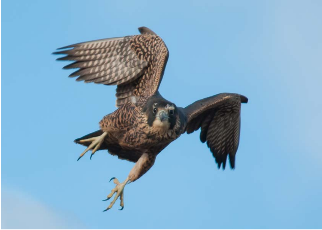
Figure 6.6. Falcon