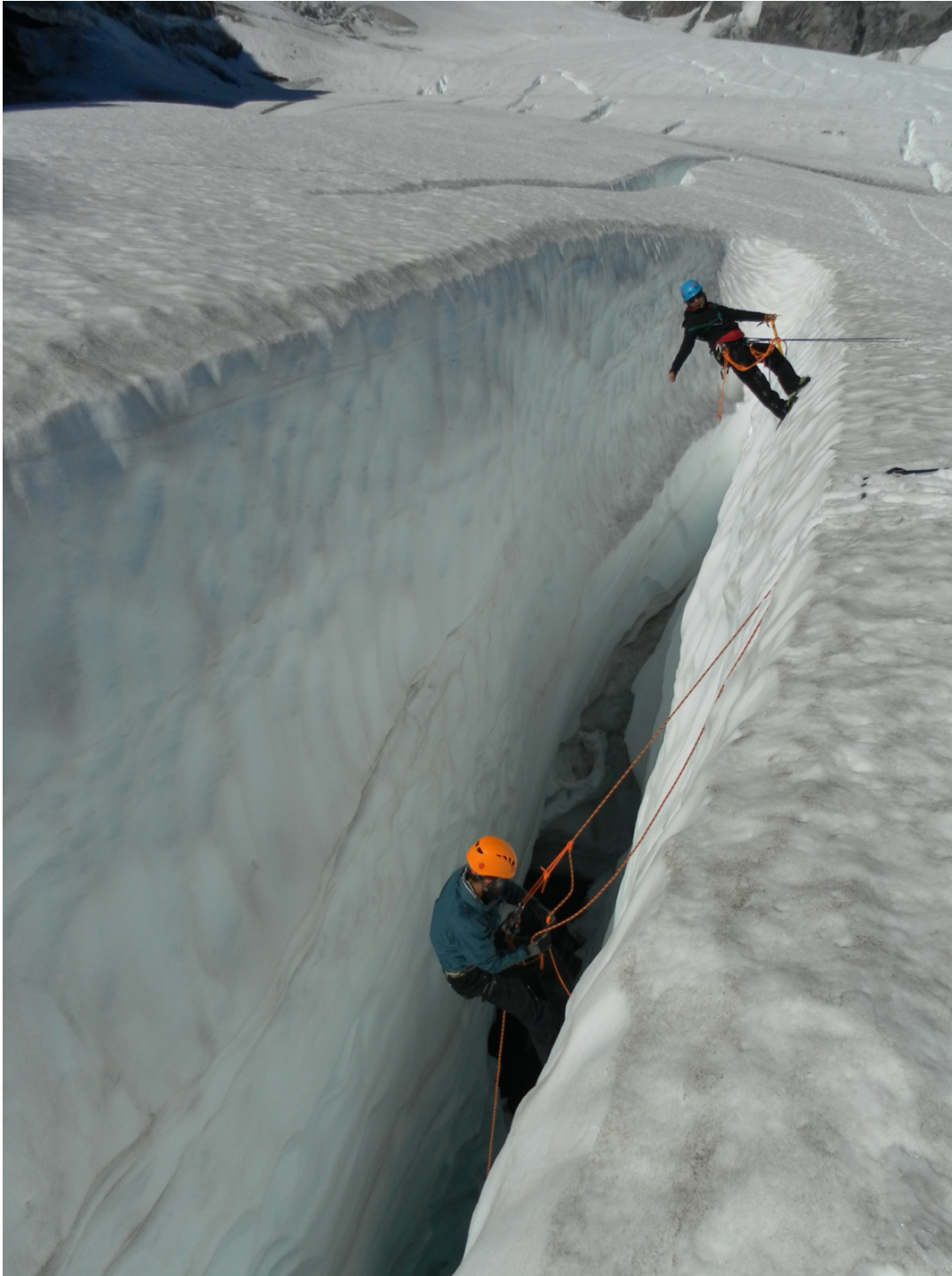
Figure 6.7. Glacial Crevasse