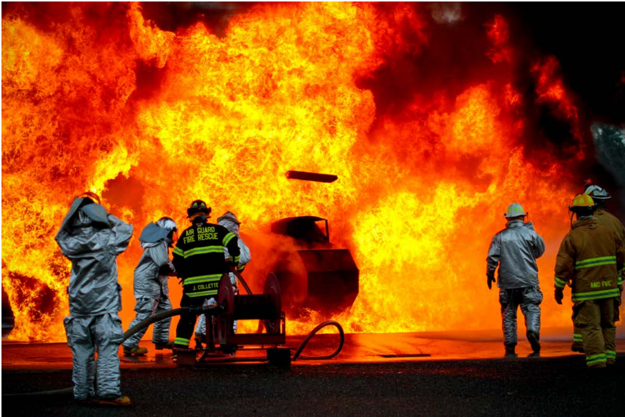
Figure 5.1. Firefighters