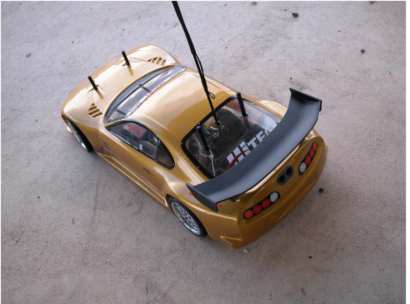
Figure 5.11. Remote Control Car