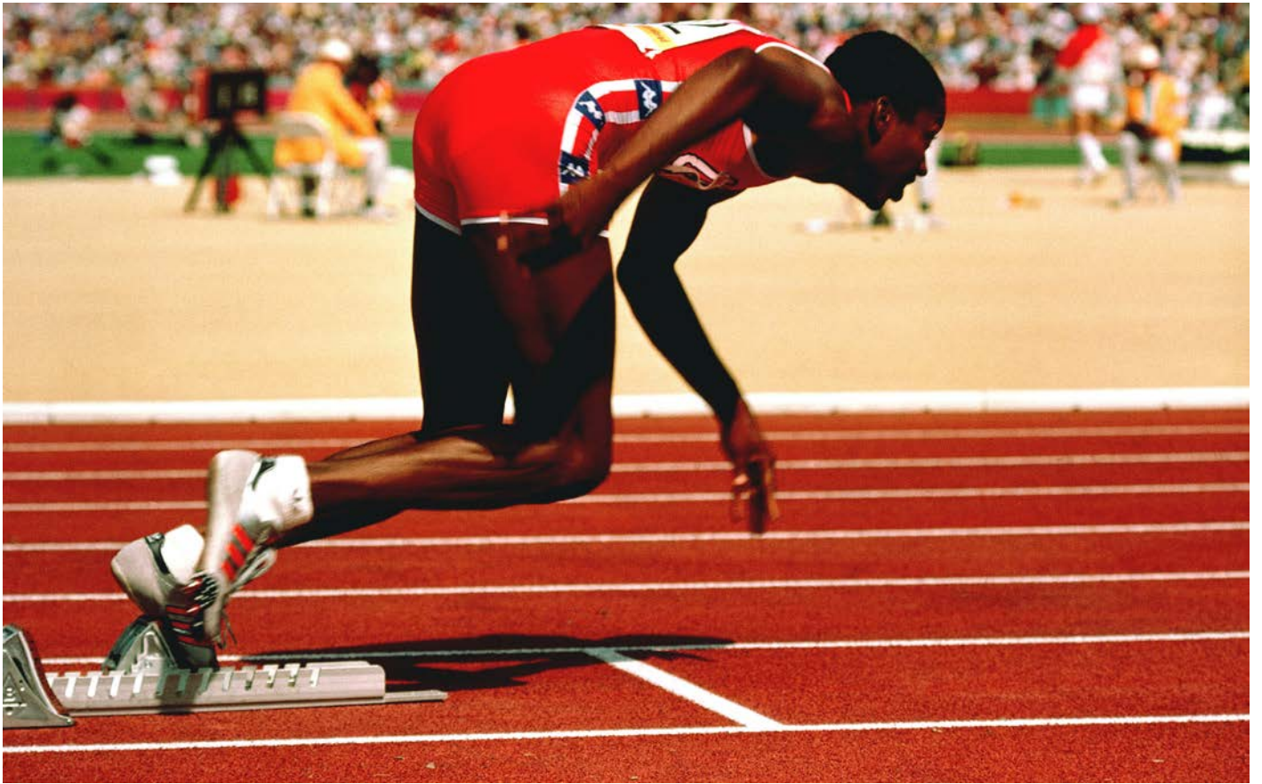
Figure 5.9. Sprinter