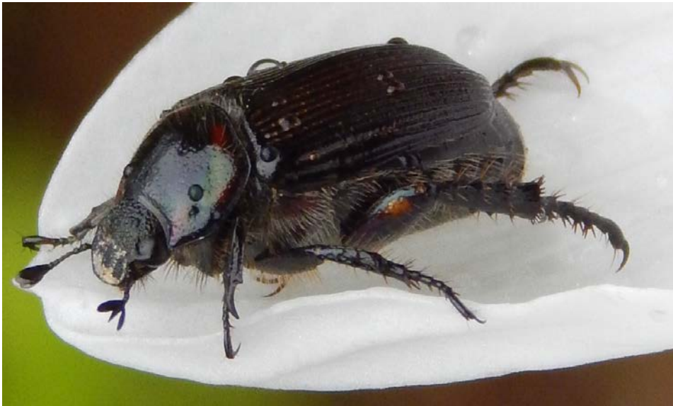
Figure 5.7. Beetles