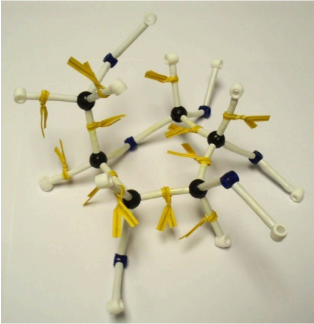
Figure 8.8. Molecular model of the sugar glucose ( C_6H_{12}O_6 )