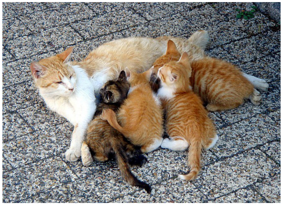
Figure 7.17. Carmen and Kittens