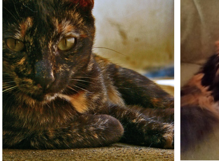
Figure 7.11. Calico Cats