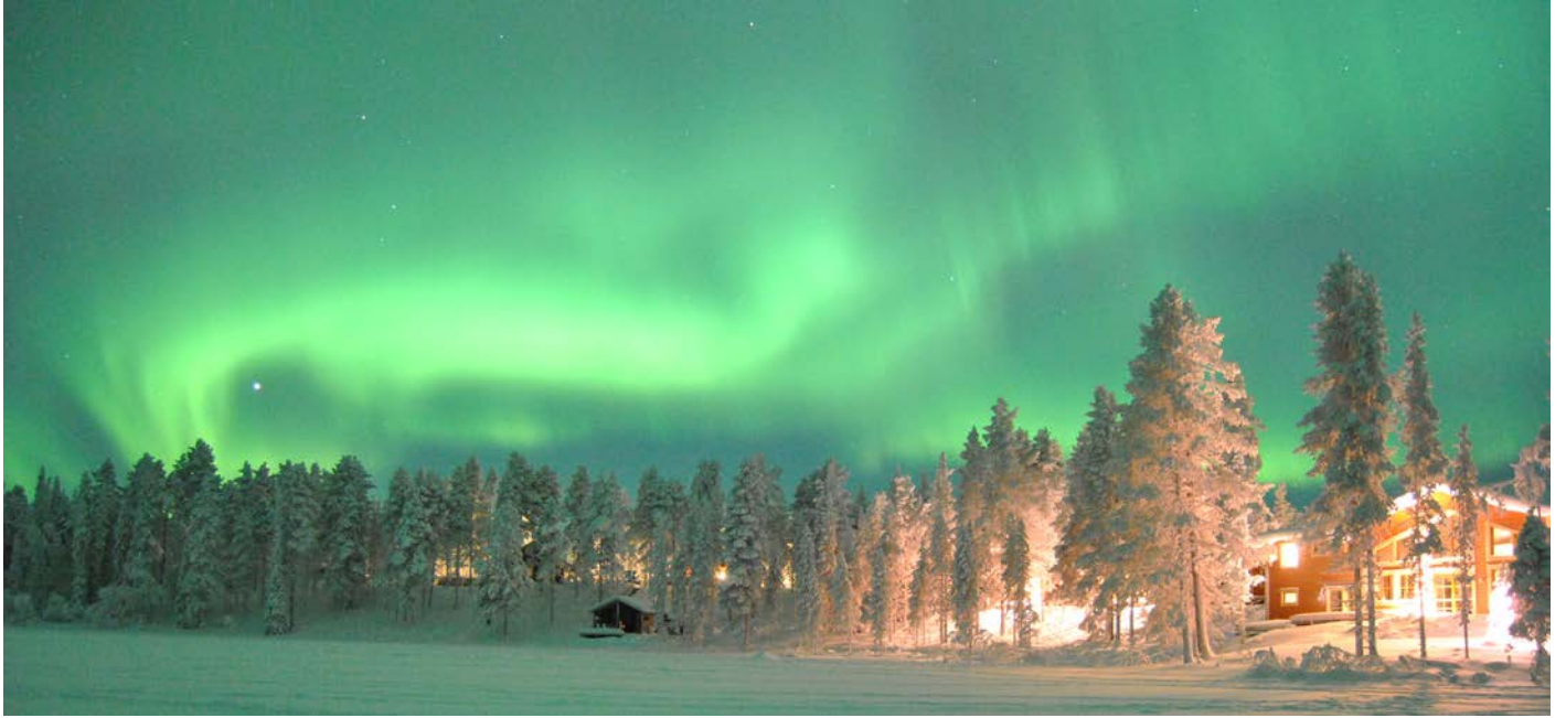
Figure 7.1. Northern Lights