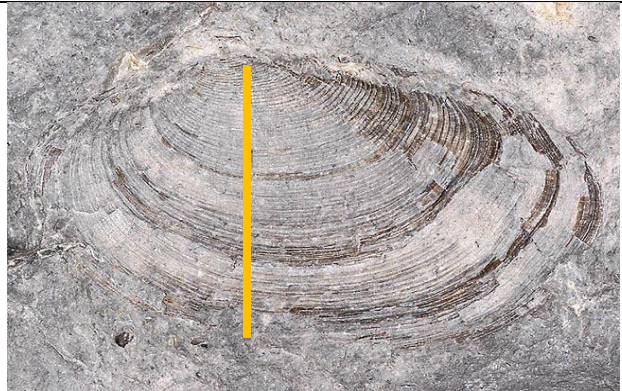
4. Clam (pelecypod) (Cooper and Spencer, 2004)