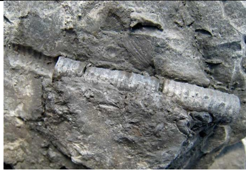
8. Crinoids (Cooper and Spencer, 2004)