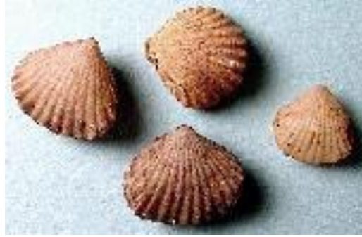
2. Brachiopods (Falls of the Ohio State Park 2005)