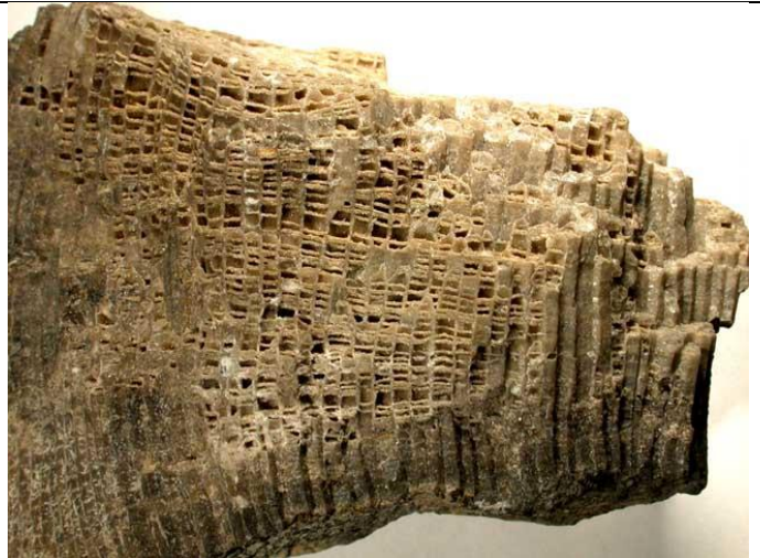
10. Honeycomb coral (Cooper and Spencer, 2004)