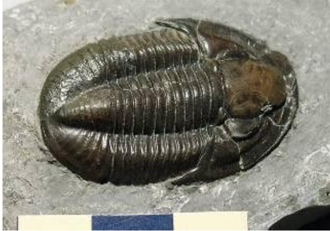
1. Trilobite (Wilson, 2015)