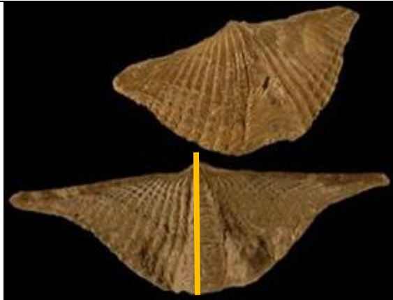
3. Mucrospirifer brachiopod.