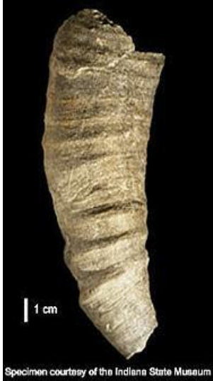
Specimen courtesy of the Indiana State Museum