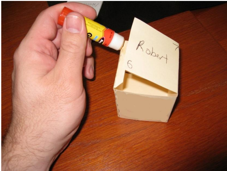
Figure 3: Gluing the final flap of the cube.