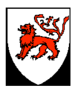
Veritas Per Explorationem

3001 Queen Victoria Rd. SE1 London, England