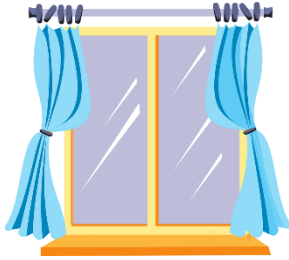
CLEAR GLASS WINDOW